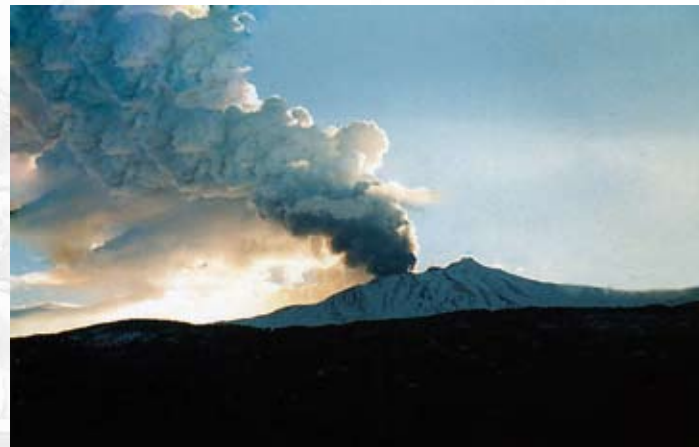
Etna (3.340) - Sicily