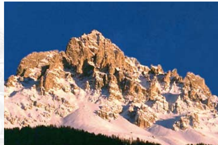
Catinaccio (3.002 m) - Trentino Alto Adige