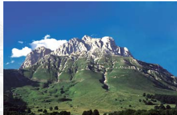
Gran Sasso (2.912 m) - Abruzzo