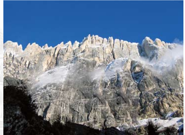
Marmolada (3.342 m) - Veneto