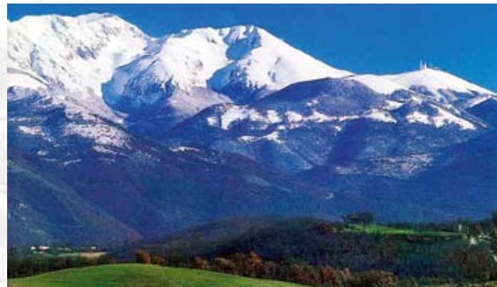
Terminillo (2.216 m) - Latium