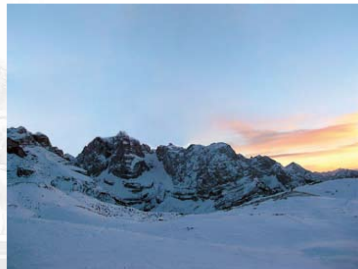
Adamello (3.539 m) - Lombardy