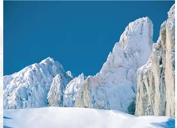
Sassolungo (3.181 m) - Trentino Alto Adige