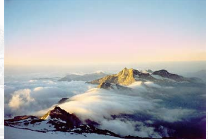
Monte Rosa (4.634 m) - Valle d'Aosta