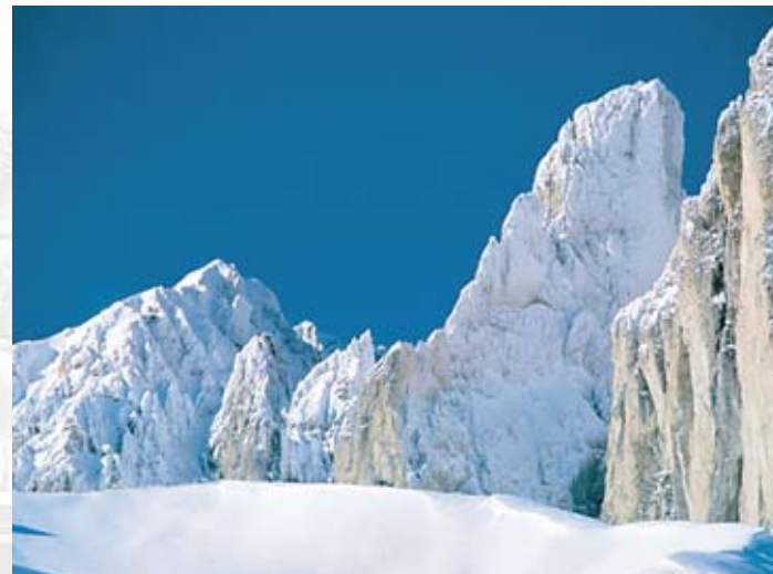
Sassolungo (3.181 m) - Trentino Alto Adige