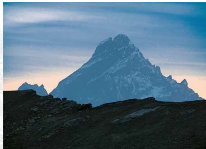
Monviso (3,841 m) - Piedmont