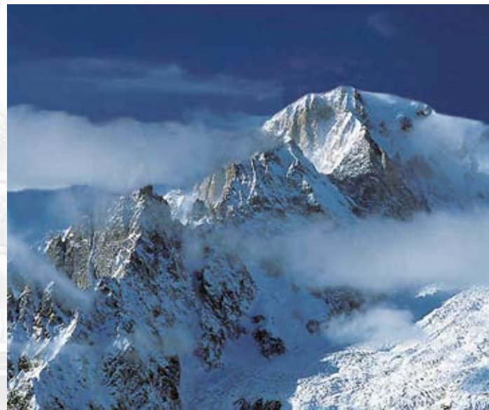
Monte Bianco (4.810 m) - Valle d'Aosta