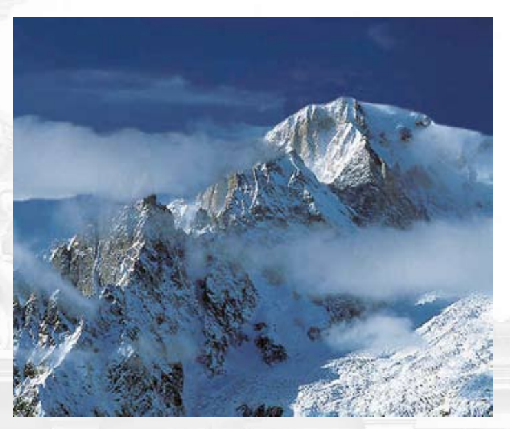
Monte Bianco (4.810 m) - Valle d'Aosta